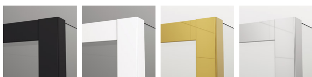
06 BLACK LINE